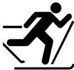
cross country skiing